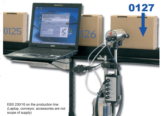
EBS 230/16 on the production line (Laptop, conveyor, accessories are not scope of supply)